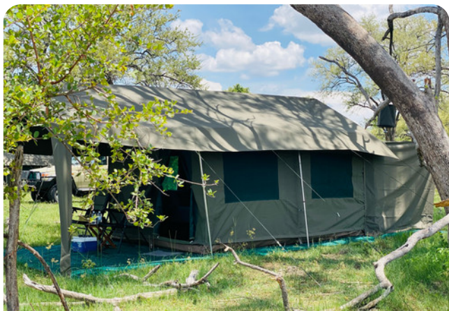
Moremi Enclave Mobile Tented Camp