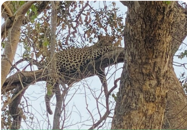
Moremi Game Reserve