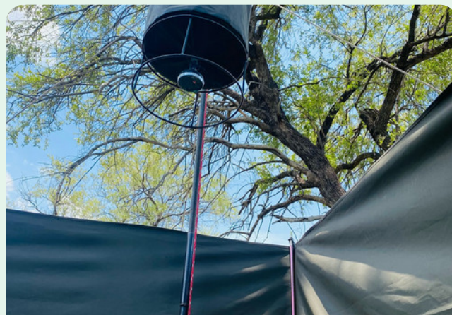
Customized hot/cold shower

Stay at Moremi Enclave Mobile Tented Camp with us. It's an excellent place to stay as you enjoy this leg of your trip.