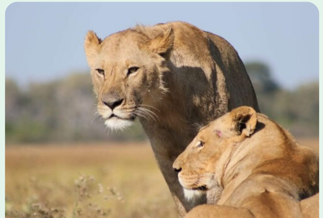
Moremi Game Reserve